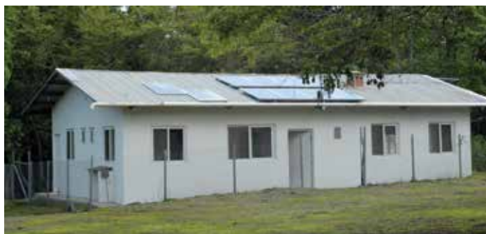
Production plant of coconut oil at Patiño's