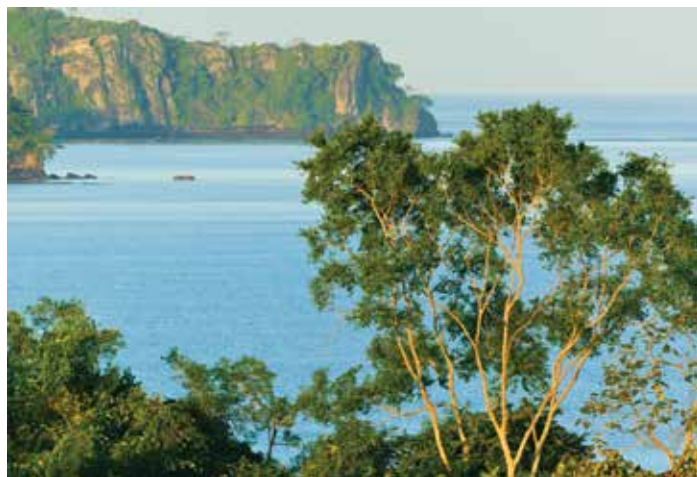
Private Nature Reserve of Punta Patiño