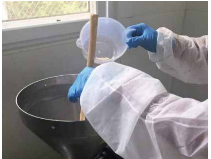
Coconut oil filtering.