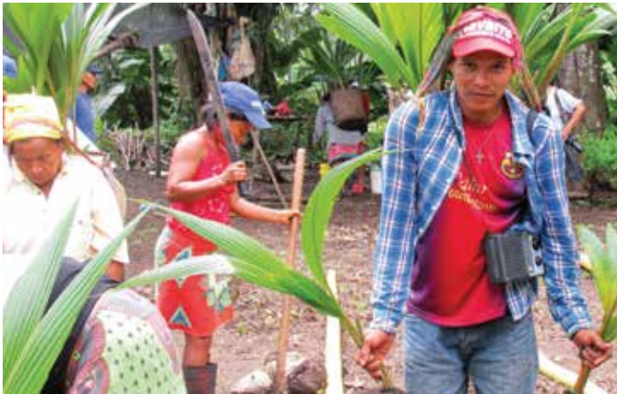
Planting coconuts ( Cocos nucifera )