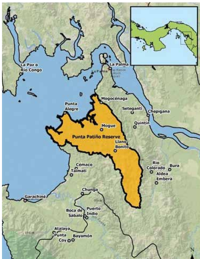
Geographical location of the Private Nature Reserve of Punta Patiño, Panama

Different groups of people live within the reserve and its surrounding areas, some are of indigenous origin. ANCON promotes several projects with these communities, in an effort to make them partners in the challenge of conserving biodiversity. Each project promotes the empowerment of these communities, teaching them to use and benefit from the resources they have on their environment in a sustainable way and improving their incomes. The semi-industrial production of coconut oil is one of such projects. Taking advantage of the areas of coconut plantations already in place before the RNP was established, the coconut oil production plant employs, since 2016, members of the communities of Cémaco and Taimatí, which have been involved in the coconut project since its outset. ARTESAN S. A., created in 2015, is the legal figure commercially selling the coconut oil. ARTESAN's coconut oil is the only brand certified by the Ministry of Health. The coconut oil is available in Panama City at several points of sale.