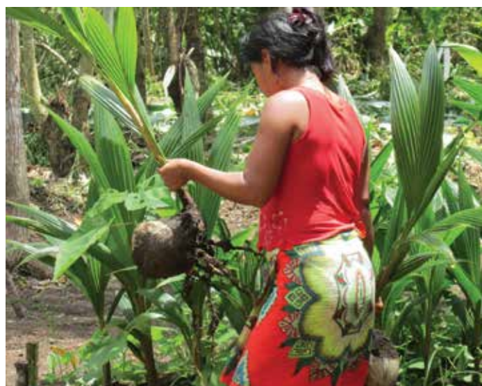
Collecting coconuts ( Cocos nucifera )