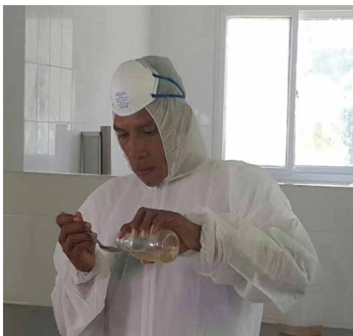
Quality control process