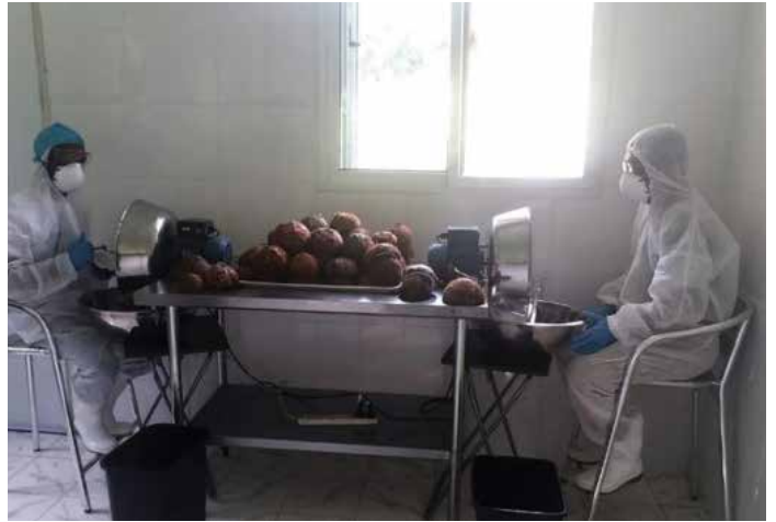
Coconut grating process.

In this case criteria 1, 2 and 4 are fulfilled.