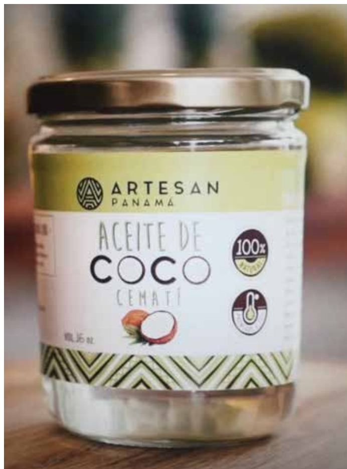
Coconut oil ARTESAN - final product

Today, only the communities of Cémaco and Taimatí are directly benefiting from the semi-industrial production of coconut oil. However, ANCON hopes to develop other projects that can improve the living conditions of more communities while promoting the sustainable commercial use of the reserve's biodiversity (criteria 1, 2 and 4). In the future, within the framework of this collaboration, ANCON and ARTESAN expect: